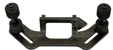
Optional guide for pipes Ø 260-600mm (10-24") Product code: PRW-0461-22-00-00-0